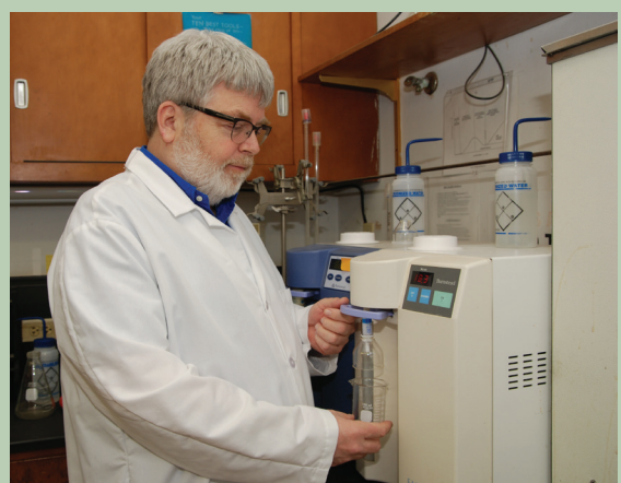
Laboratory staff continually monitor drinking water. Water quality data is posted monthly on the MCWD website (www.mcwd.org).

Fort Ord Cleanup Project: fortordcleanup.com