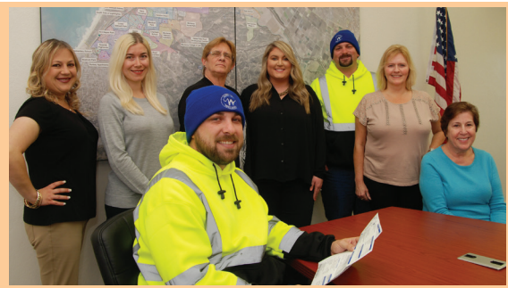
The District's Customer Service staff is available to assist you Monday through Friday, 8 AM to 5:30 PM.